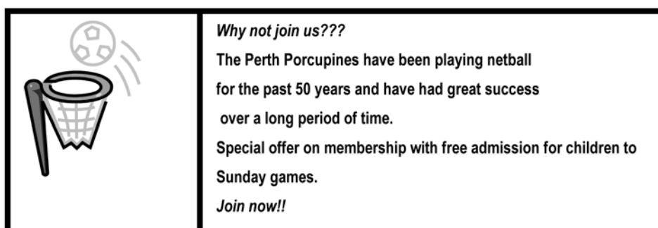
Figure 3. Artefact sample – netball advertisement.

When shown the above artefacts, students were asked questions such as ‘Is there a question you could ask about this?’ or ‘Does anything in there make you think of a question to ask?’